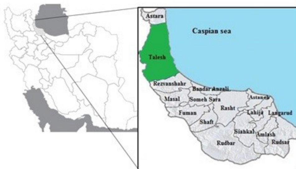
Fig. 1. Location of Talesh.

This study includes resource risk assessment, transmission line system, distribution network, and point of use of Talesh water supply system. Hazards were identified and assessed in Talesh by 10 water and wastewater experts who had sufficient experience and expertise. According to the guidelines of the WHO, examples of the most common hazards in the water supply system will be based on