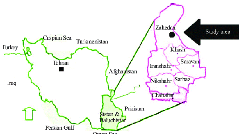
Fig. 1. Location of the Studied Region

The present study was performed in Zahedan (Fig. 1), the capital of Sistan and Baluchistan Province, Southeastern Iran (60.52° East, 29.32° North; 1384 m