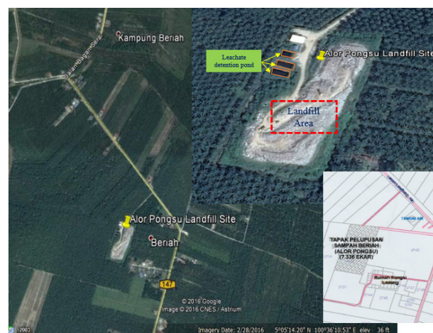
Fig. 1. Alor Pongsu Landfill Site.

Raw landfill leachate samples from APLS were collected at leachate detention pond by using 10 L and 20 L HDPE bottles. Monthly sampling was conducted between April 2016 and October 2018. The samples were then kept in cold storage at 4^{\circ}\text{C}