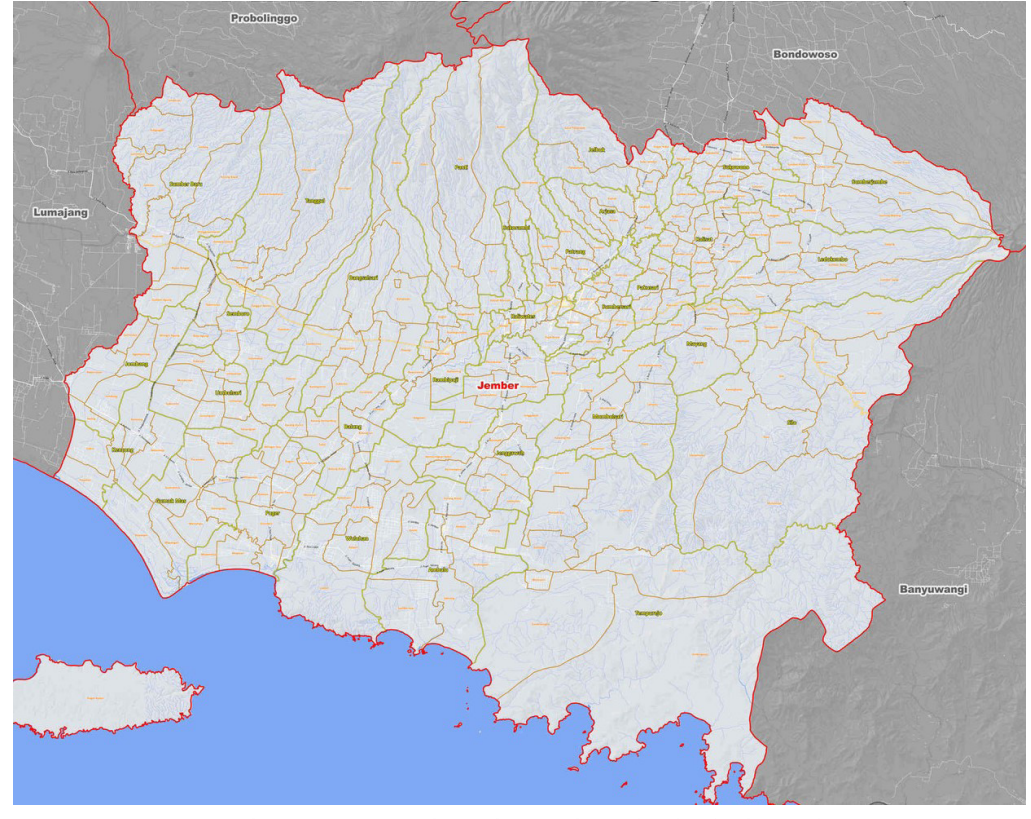
\textbf{Fig. 1}. \ \, \textbf{Jember City Map}\\

This quantitative study used an observational analytic design with a case-control approach (data from December 2022 to February 2023). It was conducted in the working area of the Sumbersari Health Center, Jember Regency, East Java (Fig. 1). This case-control study aimed to identify the relationship between the two variables in the case and control groups and to study the extent to which risk factors trigger effects (17). The population of this study included people who were part of a family living in the working area of the Sumbersari Health Center, Jember Regency, 358 people (179 in the case group and 179 in the control group). The sample size was calculated using the casecontrol formula considering a confidence interval of 95%, significance level of Z_{1-\alpha/2} = 1.96 , the error rate of \alpha = 0.05 , P_1 = 0.299 , and P_2 = 0.162 . Finally, a total of 140 participants were included in the case group and 140 participants in the control group. The research sample was taken using the simple random sampling technique in Microsoft Excel. The respondents who met the inclusion and exclusion criteria were included in the study. The inclusion criteria for both the case and control groups were being part of a family living in the Sumbersari Health Center work area and using clear water daily. Respondents who were not